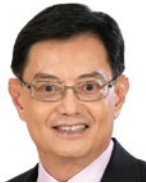
Heng Swee Keat (Former Deputy Prime Minister, Former Minister for Finance, Singapore)