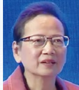
Tarisa Watanagase (Former Governor of the Bank of Thailand)