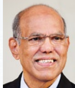
Duvvuri Subbarao (Former Governor, Reserve Bank of India)