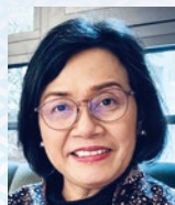
Sri Mulyani Indrawati (Former Minister of Finance, Indonesia)