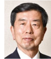
Takehiko Nakao (Former President, Asian Development Bank)